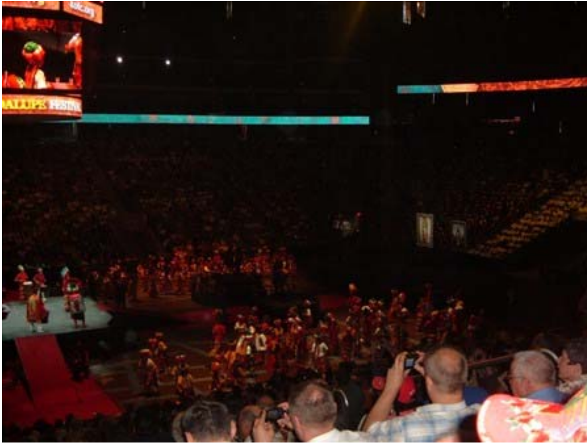
Local Indian presentation at Our Lady of Guadalupe Festival held as part of the Supreme Convention.